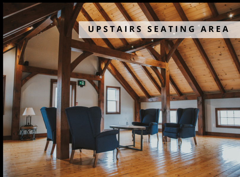
UPSTAIRS SEATING AREA

THE PEG'S BEAUTIFUL POST AND BEAM CONSTRUCTION OFFERS A BLANK CANVAS FOR A BRIDE AND GROOM TO PERSONALIZE WITH THEIR OWN WEDDING DÉCOR. THE ADJACENT OUTDOOR PATIO INCREASES THE CREATIVE SPACE TO HOLD WEDDING, RECEPTION AND DANCE ALL AT ONE CONVENIENT LOCATION.